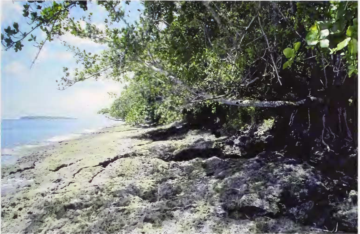
Fig. 2. Coast line with coral limestone deposits on Salibabu Island. Habitat of Varanus sp. and Emoia a. atrocostata .

The geographically isolated position between three biogeographic subregions in the centre of the Indo-Australian Archipelago render the Talaud Islands an interesting field of research for biogeographers. Until recently, however, the Talaud Archipelago (together with Sangihe) has been one of the least-known areas of the Sulawesi region as defined by VANE-WRIGHT (1991). Hence, due to their minor geographic size together with their remote location, the Talaud Island group has been paid only little attention by herpetologists in the past and scientific literature about the herpetofauna of this small archipelago is scarce. VAN KAMPEN (1907; 1923) and DE ROOIJ (1915; 1917) provided the first herpetological data about the Talaud Islands based on material collected by M. WEBER during the Siboga Expedition of 1899. DE ROOIJ (1915; 1917) listed five different lizard species ( Calotes jubatus , Varanus indicus , Lygosoma cyanurum , Lygosoma rufescens , and Mabuia multicarinata ) and one snake species ( Candoia carinata ). Later, DE JONG (1928) published the results of another small collection by the Dutch botanist H. J. LAM who visited Karakelong and Salibabu as well as Miangas, a small islet south of Mindanao, in 1926 (LAM 1926; 1942). His Talaud collection comprised ten different species representing eight lizards and two snakes. Voucher specimens by M. WEBER and H. J. LAM from the Ta-